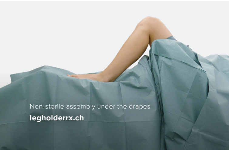
Non-sterile assembly under the drapes legholderrx.ch