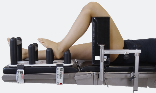
Self-retaining knee position with lateral support on the thigh